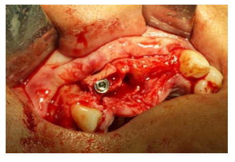
Figure IV - The implant 1 mm beyond the bony ridge in the 12 region, set in primary stability Titanium Fix<sup>®</sup> of 3.75x15.0 mm External Hexagon platform.

The reason may lie in the type of bony ridge where this technique can be applied, which should be considered to increase the rim only occur horizontally. The technique should only be applied when the buccal and lingual / palatal walls are separated by medullary bone<sup>7,11,12,13,14,5,16</sup>.