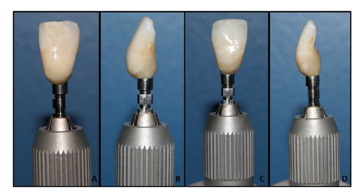
Figure 7 - (A) Buccal appearance of the tooth #11 (B) Medial appearance of the tooth #11. (C) Buccal appearance of the tooth #21 (D) Medial appearance of the tooth #21. Note the quality of the resin and polishing of the facet, which will allow proper adjustment and passive soft tissue and possible long-term quality.

predicted using a diagnostic protocol with five keys that may be evaluated and used for decisions. This protocol includes: (I) relative tooth position, (II) form of periodontium, (III) biotype of periodontium, (IV) tooth form and (V) bone crest position]. In the case described here, for example, the gingival phenotype was extremely thin and unfavorable if not carefully handled, as there was the chance of retraction, implant transparency or visibility of prosthetic abutments through the tissues. This was thoroughly evaluated together with the patient, who was told about all treatment biases, as well as about the necessary hygiene and care that should be observed to preserve the prosthesis.