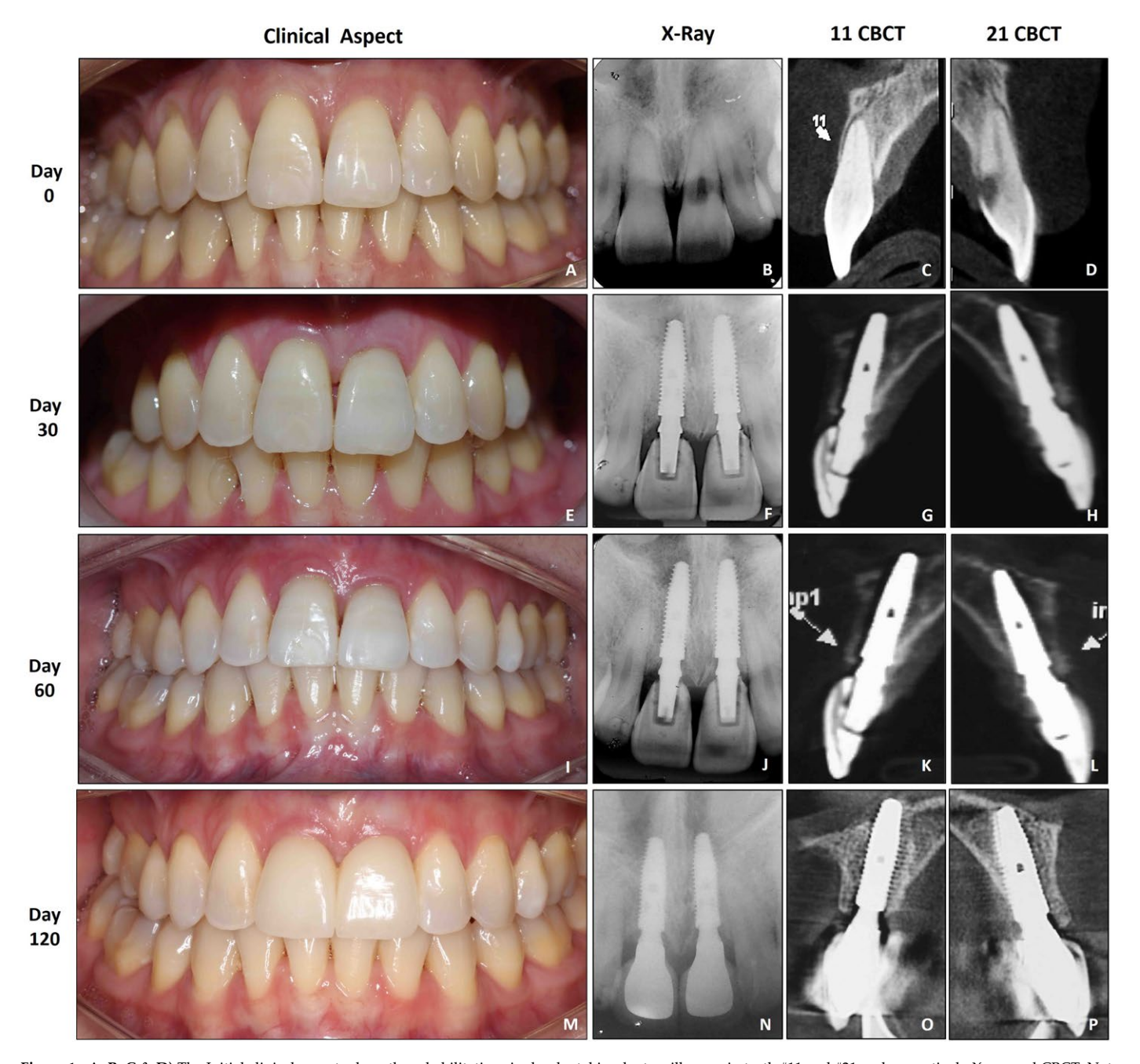
Figure 1 - A, B, C & D) The Initial clinical aspect where the rehabilitative aim by dental implants will occur in teeth #11 and #21 and respectively X-ray and CBCT. Note the quality of the gum tissue and health, as the slender phenotype making it very difficult treatment. E, F, G, H) 30 days postoperatively after dental implants installation, the x-ray showing CBCT maintaining the vestibular bone. I, J, K, L) 60 postoperative days of dental implants placement. Note, both rx and in CBCT the maintenance of bone tissue. M, N, O, P) 90 days postoperatively. The respective radiographic and tomographic examinations have in maintaining the quality of the bone tissue and the line obtained by this technique.

Her history was carefully examined, and her report revealed that, when she was in her early adolescent years, she suffered dentoalveolar trauma with avulsion of her two maxillary central incisors (tooth #11 and #21). The dentist that treated her at the urgency service at that time repositioned the two teeth and used retention for three weeks. During her examination, the patient produced the written referral from her endodontist, who, after