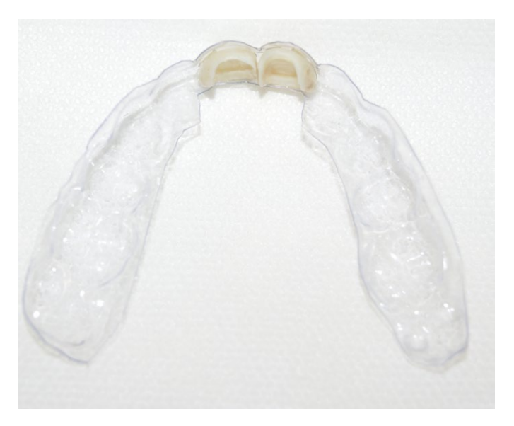
Figure 6 - The surgical guide with facets aspect of prior to mouth placement. Note the adaptation and ease of placement that this technique provides, allowing reproduction of the teeth initial position.