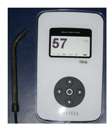
Figure 4 - ISQ value obtained through the resonance frequency analysis (Osstell®) device, where the value was 57 ISQ, allowing the realization of immediate loading on the newly installed dental implants.

Restorations using prostheses over implants in the esthetic region and preserving gingival architecture in harmony with adjacent tissues is one of the great challenges in current Implant Dentistry. Esthetic peri-implant results may be more accurately