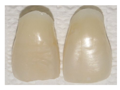
Figure 5 - #11 and #21 natural teeth veneers were cautiously made from palatine faces worn in high rotation turbine of newly extracted elements for provisionalization.