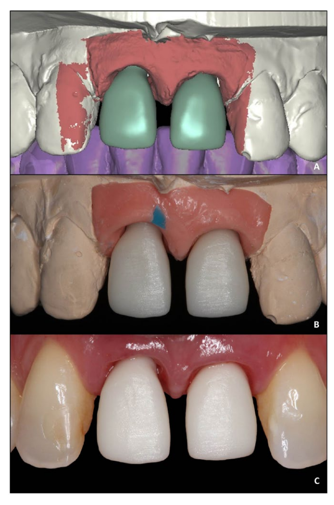
Figure 11 - Copping Zirconia comparison on dental implants # 11 and # 21 region - (A) scanning the plaster model virtually performed (NEODENT® Curitiba, Brazil), as well as making the virtual structure of the zirconia abutment; (B) coppings on the actual plaster model (B); proved mouth (C). Note the quality of the adaptation and the similarity among the three situations showing great reliability of the technique.

before surgery. Moreover, preserved gingival health and the correct and natural three-dimensional positioning of peri-implant tissues were confirmed during monthly follow-up visits<sup>15,19</sup>, <sup>21-25</sup>.