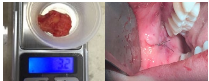
Figure 4 - Fat weighing on a precision scale. Figure 5 - Synthesis