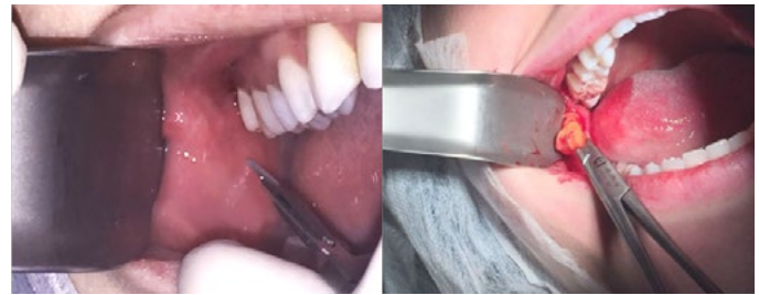
Figure 1 - intraoral incision of 1 cm, parallel to the duct output of the parotid gland. Figure 2.a - initiation traction of the Bichat's fat pad.

Comparing multifilament yarns with monofilament yarns it is usually observed more favorable tissue reaction to monofilament yarns due to less possibility of bacterial retention 9 .