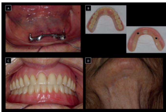
Figura 2 - Implant supported prosthesis nine months after the surgery A . Overdenture bar installed B . Superior and inferior aspect of the prosthesis C . Implant supported prosthesis in function D . Extra-oral incision appearance after one year of the surgery.

1h). Nine months after the surgery, the patient had no further complications, and rehabilitation treatment was completed (Figure 2).